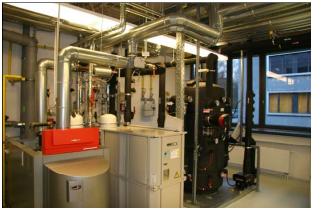
Fig. 1: Test bench (from left to right): gas-condensing boiler, compression chiller, thermal storage

The analysis of constructive and material-technical issues of BHEs represents another important topic. Here, mechanically, thermally and chemically induced damages on geothermal probes are under investigation. BHE installation mistakes are a frequent cause of mechanical damage. Structural damage in the grout material caused by intensive and rapid frost-thaw cycles is one of the reasons for thermally induced damage. As a possible consequence, undesired annular gaps between grout and probe may form. If a damaged segment of borehole backfilling is located in the depth of aquifers, this is critical with regard to the system tightness, demanded by the authorities. The same is true in case of chemical decompositions of the grout caused by unsuitable materials in corrosive underground conditions. Without the presence of groundwater, the cavities or defects within the grout act as a thermal insulation, which leads to a reduction in the BHE performance. Therefore, the objectives of research are to analyze possible damages caused by means of multiphysical simulations and to derive recommendations for reduction of risk of damage.