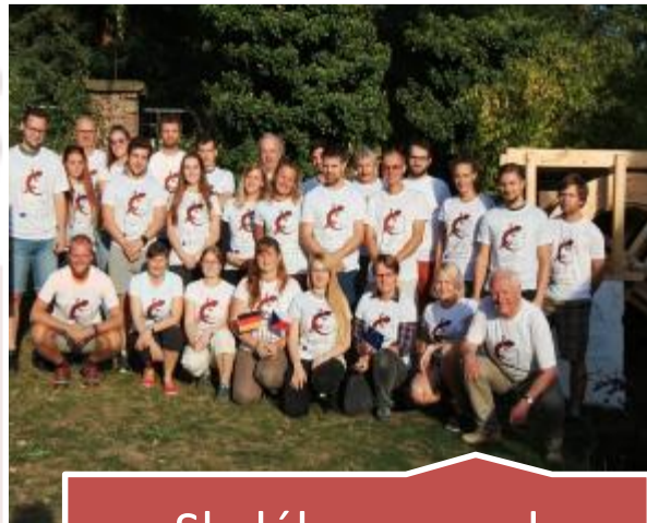
Skalákovna pod Ještědem