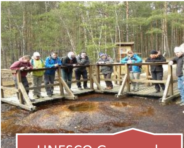
UNESCO Geopark Muskauer Faltenbogen