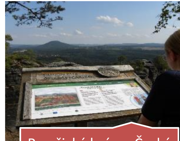
Pravčická brána, České Švýcarsko