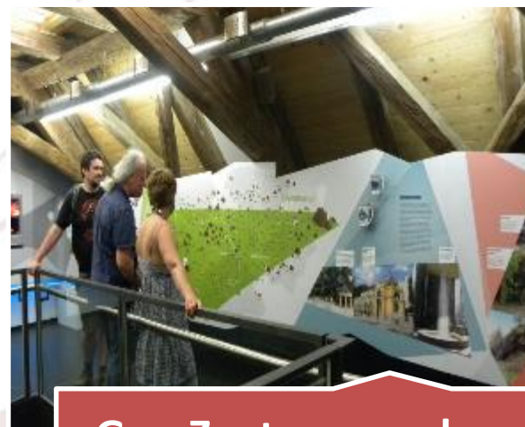
Geo-Zentrum an der KTB